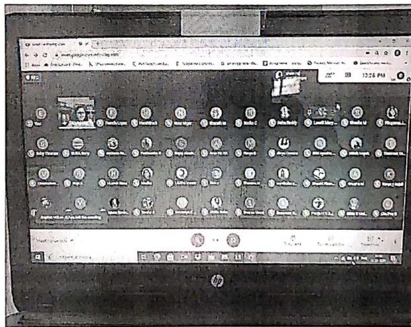
Participants of the Infinity guest lecture organized by Department of English