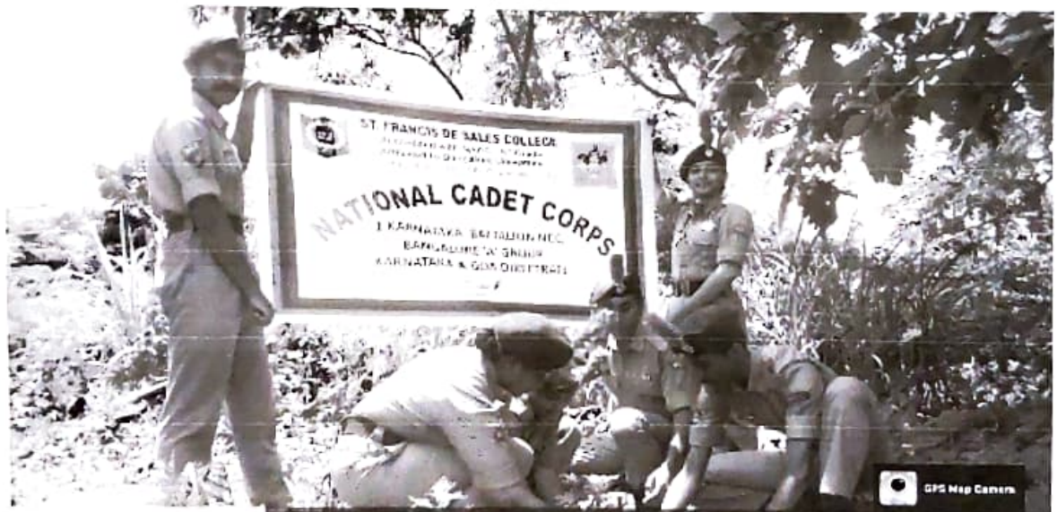
GPS Map Camera