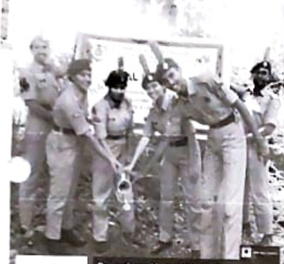
Bengaluru, Karnataka, India RMJM+J2H, Kammasandra, Electronic City, Bengaluru, Karnataka 560100, India Lat 12.831434° Long 77.683136° 03/06/22 11:34 AM