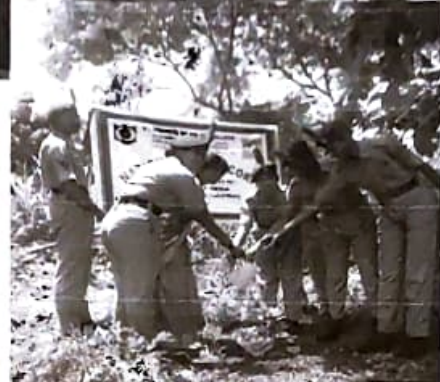
Bengaluru, Karnataka, India RMJM+J2H, Pragasl Patis Apartment Rd, Kammasandra, Electronic City, Bengaluru, Karnataka 560100, India Lat 12.831361° Long 77.682197° 03/06/22 11:33 AM