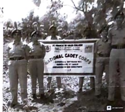
Bengaluru, Karnataka, India RMJM+J2H, Kammasandra, Electronic City, Bengaluru, Karnataka 560100, India Lat 12.831426° Long 77.68315° 03/06/22 11:36 AM