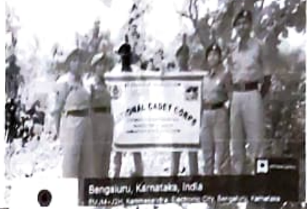
Bengaluru, Karnataka, India RMJM+J2H, Kammasandra, Electronic City, Bengaluru, Karnataka