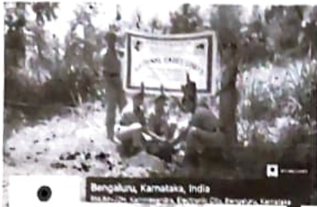
Bengaluru, Karnataka, India RMJM+J2H, Kammasandra, Electronic City, Bengaluru, Karnataka