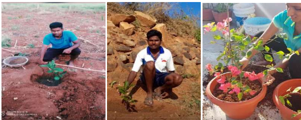
2020 BCOM D students