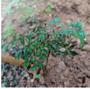
Sahana.M-I BBA A-2022 Batch