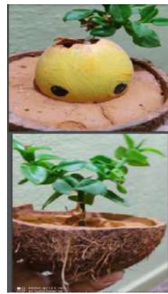
Monika.S I BCOM E-2020 planted a Palm Tree Thanushree.B I BCOM E-2021, Apteia