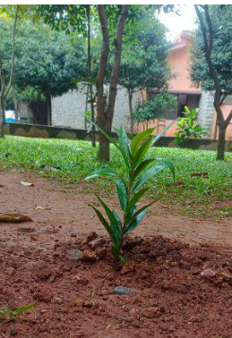
Bharath.V-I BBA A-2022 Batch