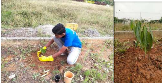
Yashash-I BCOM C 2022 Batch