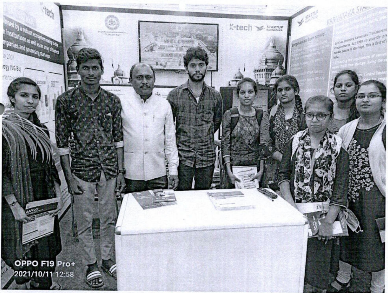
OPPO F19 Pro+ 2021/10/11 12:58