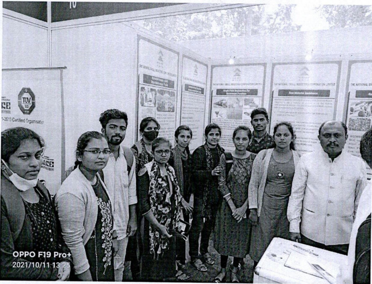
OPPO F19 Pro+ 2021/10/11 13:25