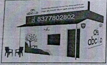
ಕಾಲ್ ಸೆಂಟರ್ : 8377802802