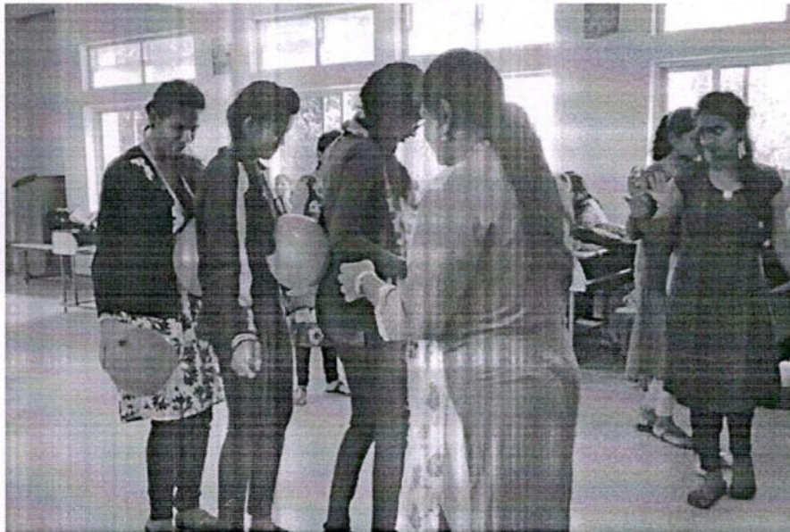
A team of students participating enthusiastically in Team building activity held on 9&10 April