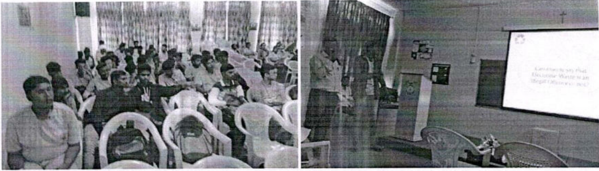
Students are listening to the rules and regulations of the HR activity held on 31 st August 2018