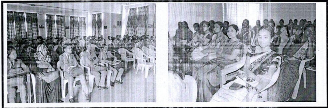
A view of participants during the workshop