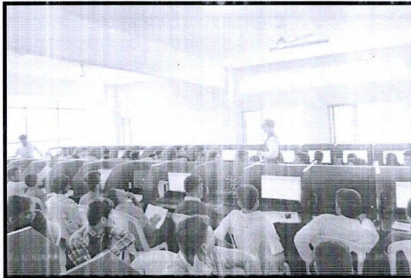
Hand on session during the workshop