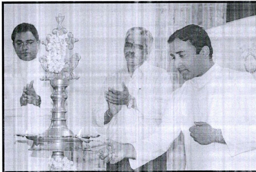
Inauguration of the seminar