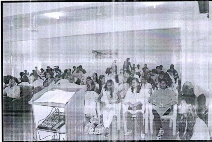
A view of audience during the session