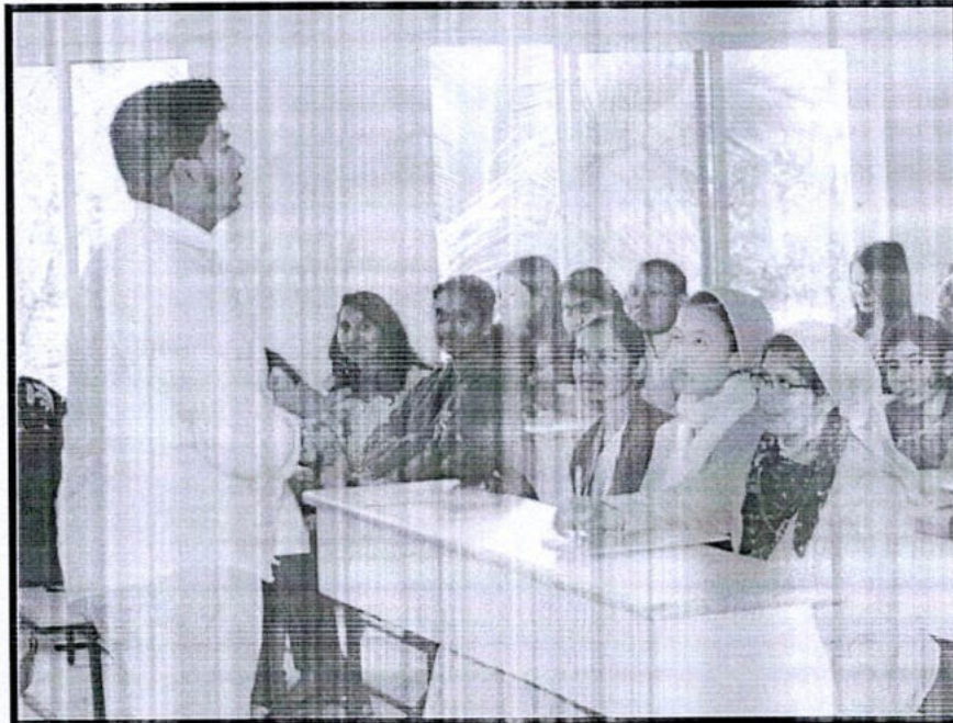
An interactive session during the workshop