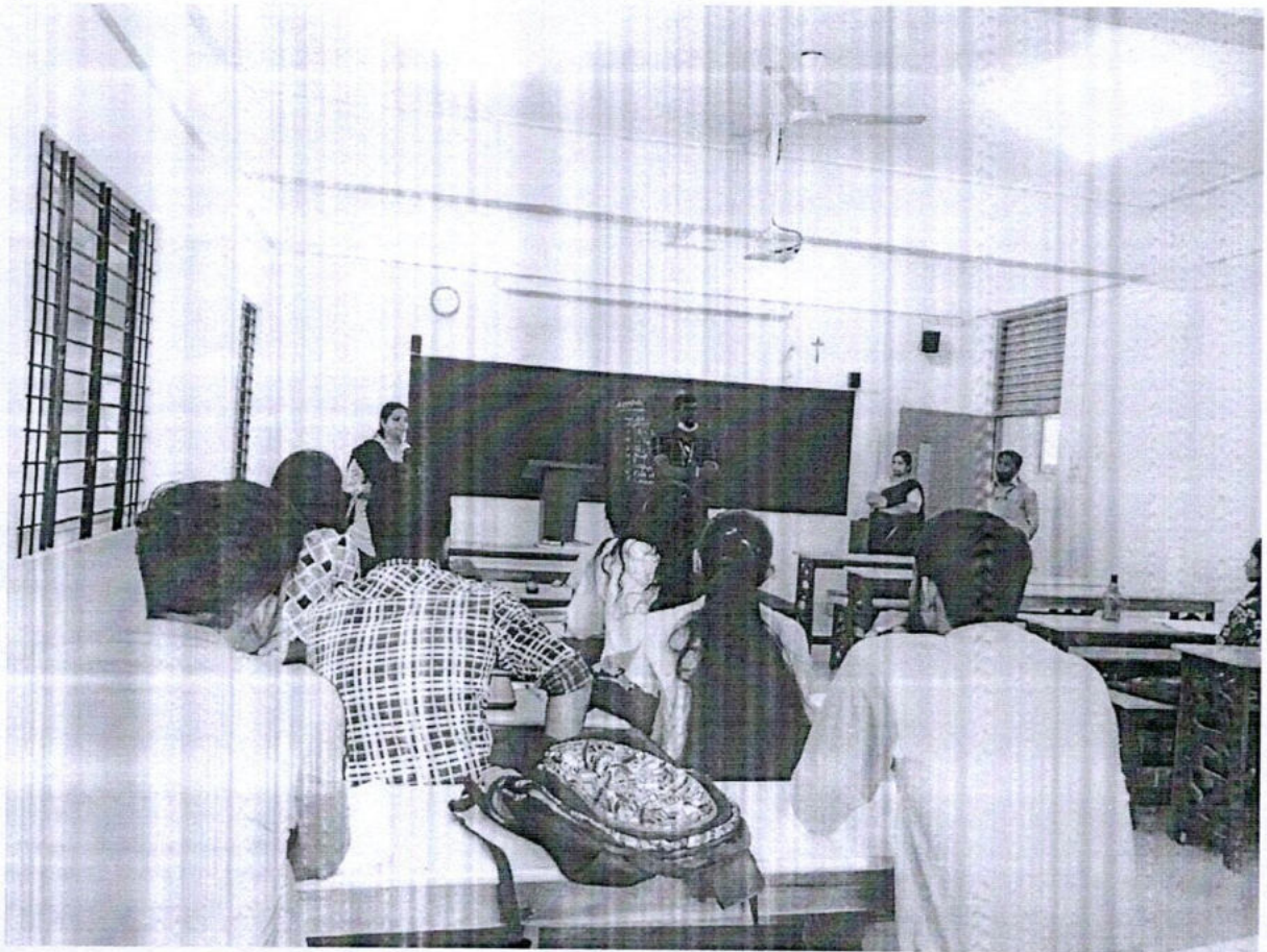
Pre Placement Talk by the Placement Cell for the Campus Drive for Industry Era