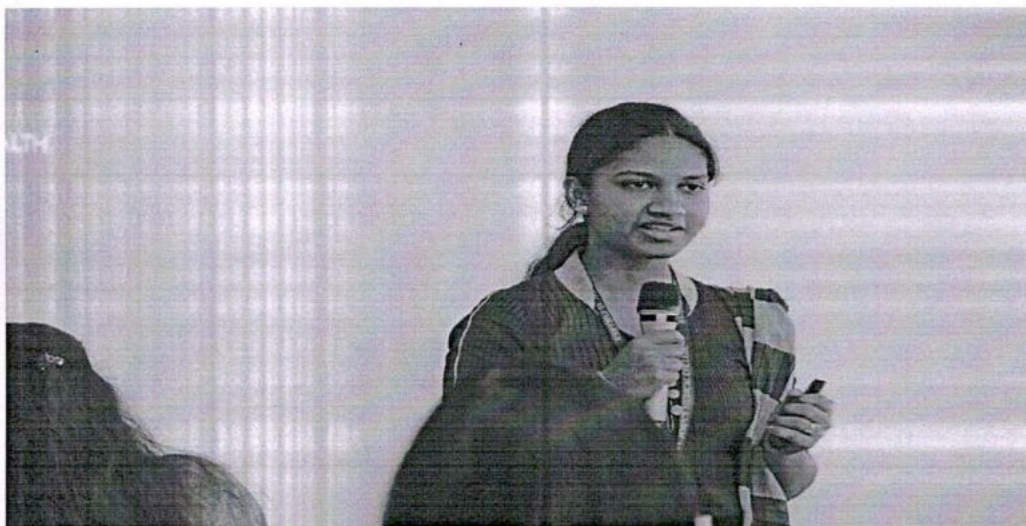
Resource person addressing the queries of students