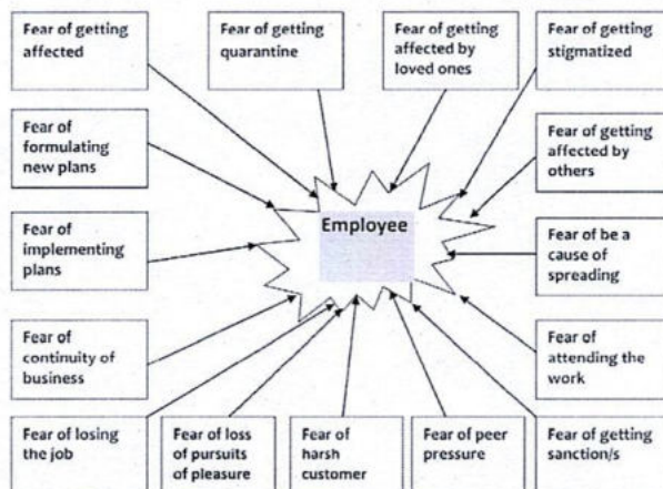
Figure: 1 Types of Employee Fear owing to Coronavirus

granted, and therefore all sections of our society –including businesses and employers – must play a role if we are to stop the spread of this disease (World Health Organization, 2020). Ensuring employee health through the prevention and preventive actions will have to be taken before employees become infected and corrective actions will have to be taken after employees become infected and control of COVID-19, and how organizations have actually encountered this danger.