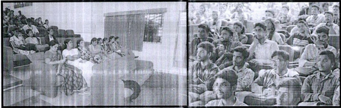
Faculty members and students attending the workshop