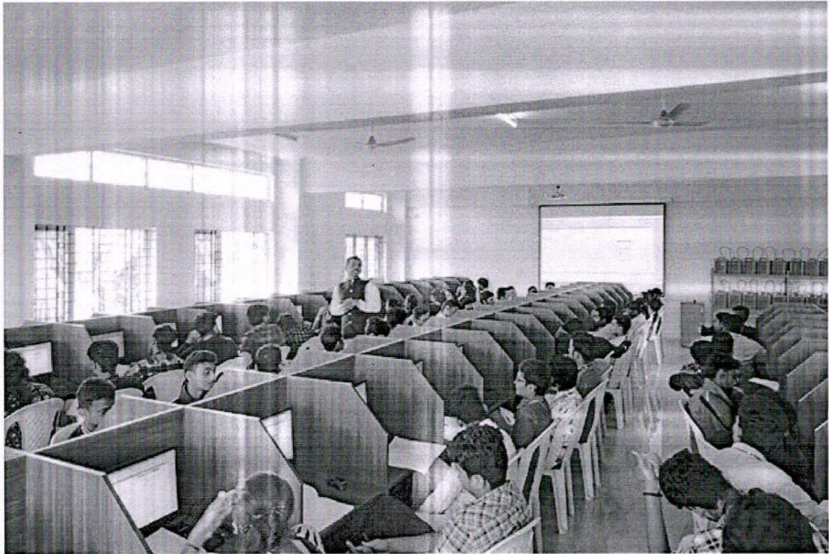
A glimpse of MS Office session held on 20th August, 2018