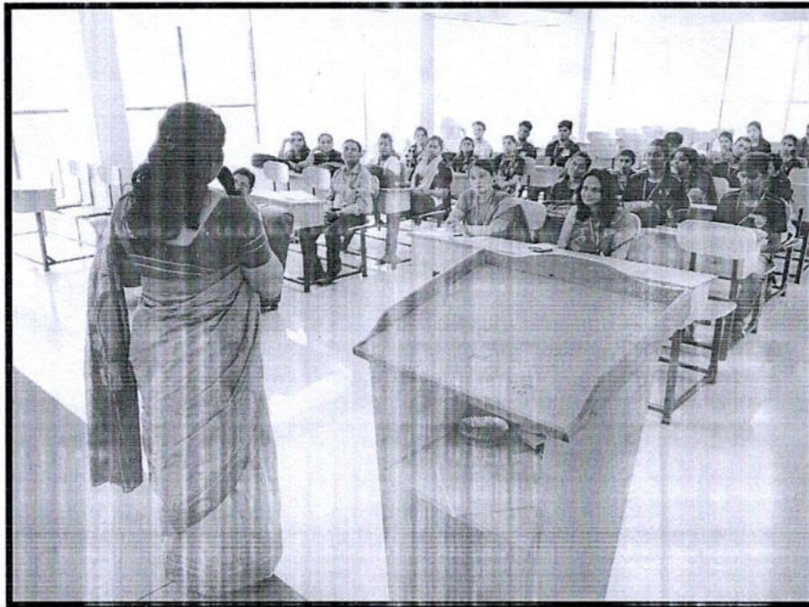
A view of the invited talk