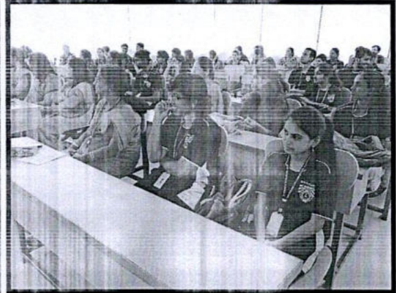
Presentation by the delegates and a view of the participants