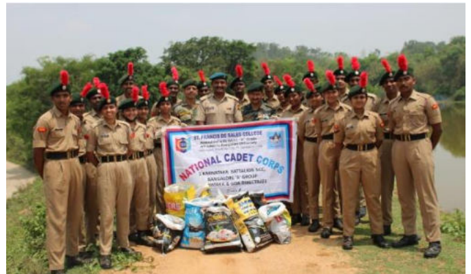
Puneeth sagar Abhiyan (Agra Lake) by NCC- 22/04/2022