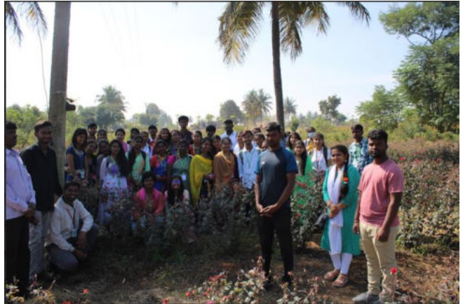
Raitha mitra sangama by DFFA - 23/12/2022