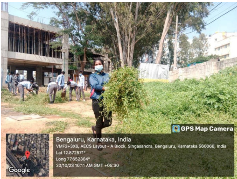
Cleaning Near Singasandra Village under swatch Bharath Abhiyan – 20/10/2023