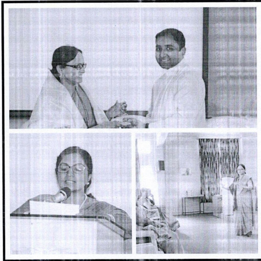
A glance of the seminar