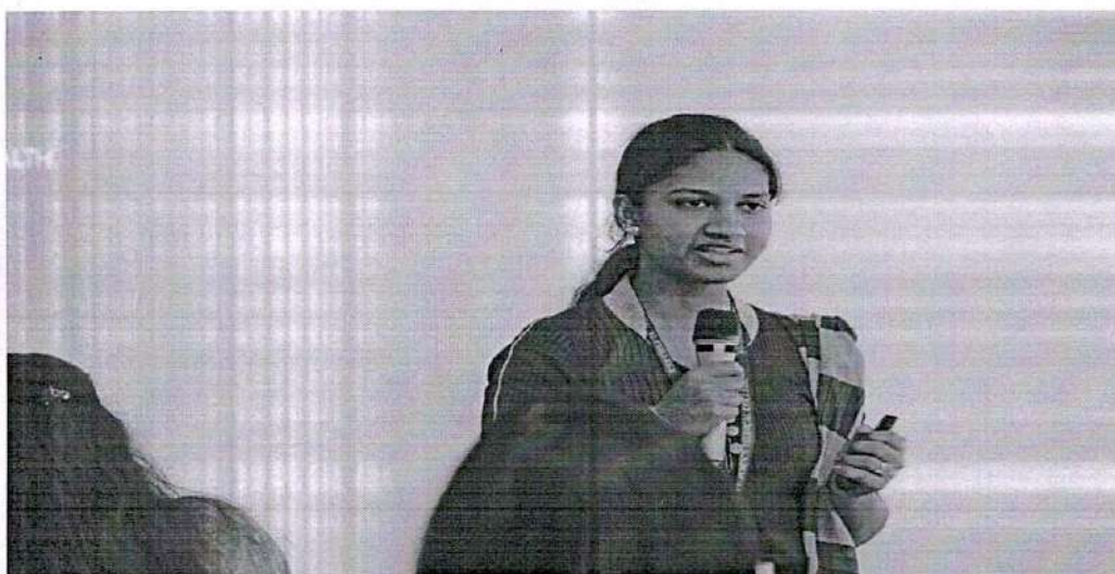
Resource person addressing the queries of students