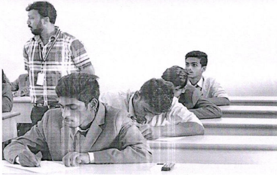
Students are participating in the Diary Entry activity conducted by Chaucer's Academy on 14th February 2019.