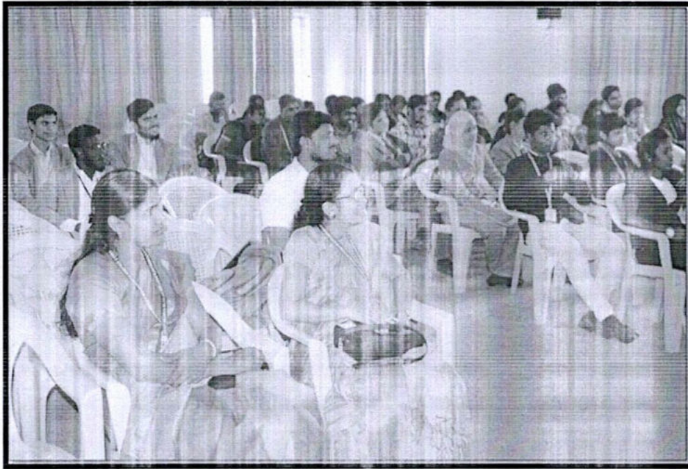
Faculty members and students attending the session on Big data Analytics