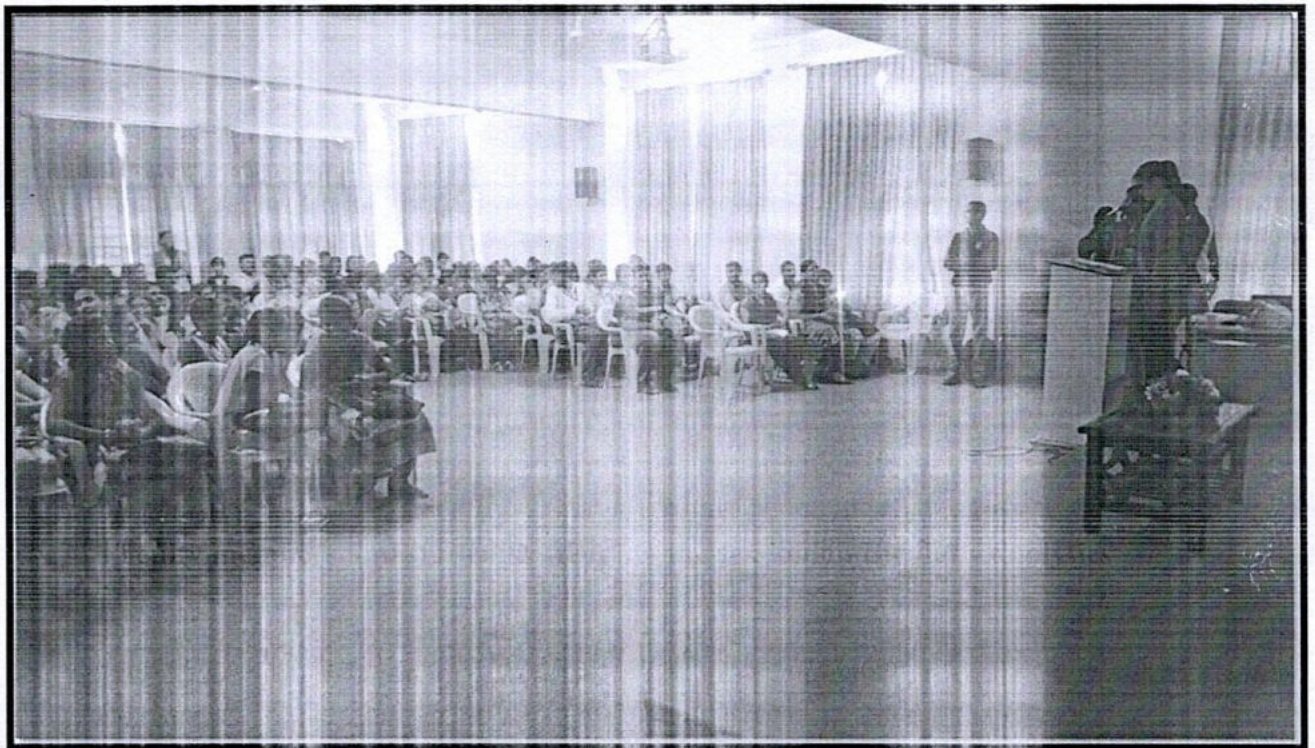
The audience for the session on cyber security