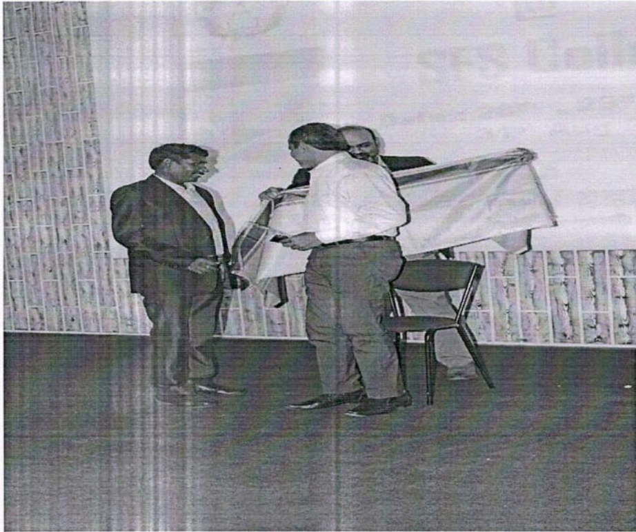
Honouring the resource person