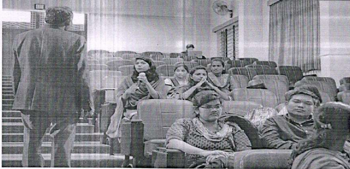
Question answer session with resource person