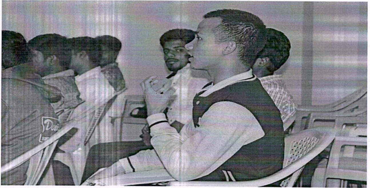
Question answer session with resource person