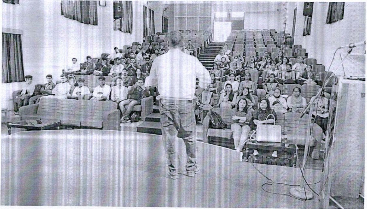
Pre-Placement Talk by the HR -Avention Technologies