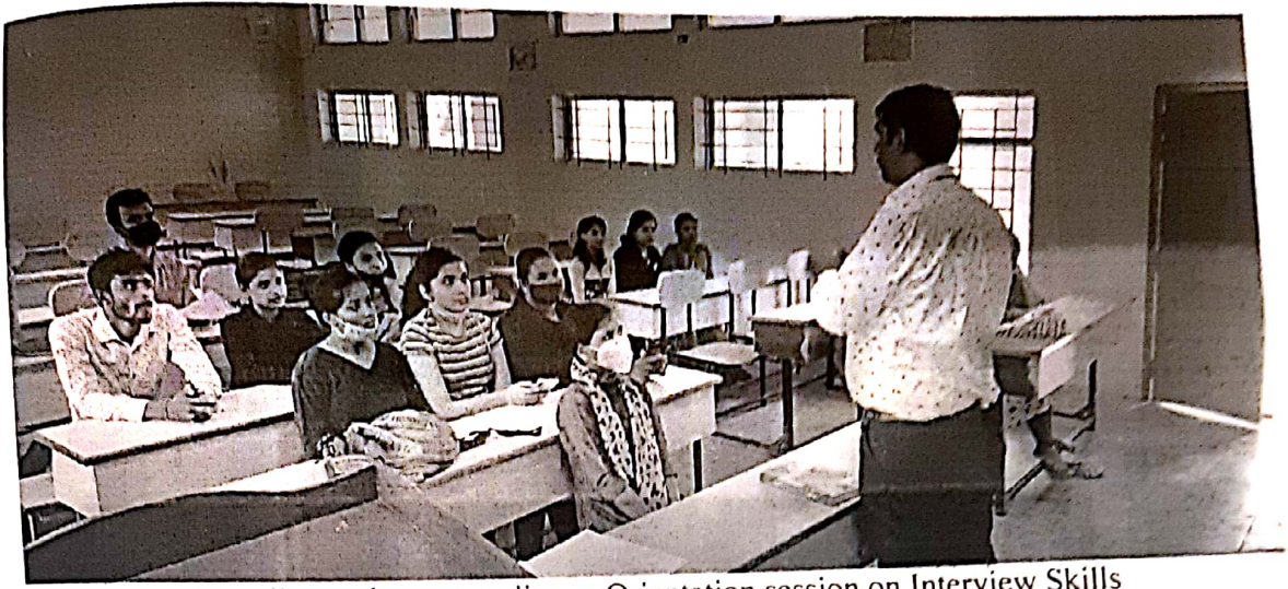
Desalite students attending anOrientation session on Interview Skills