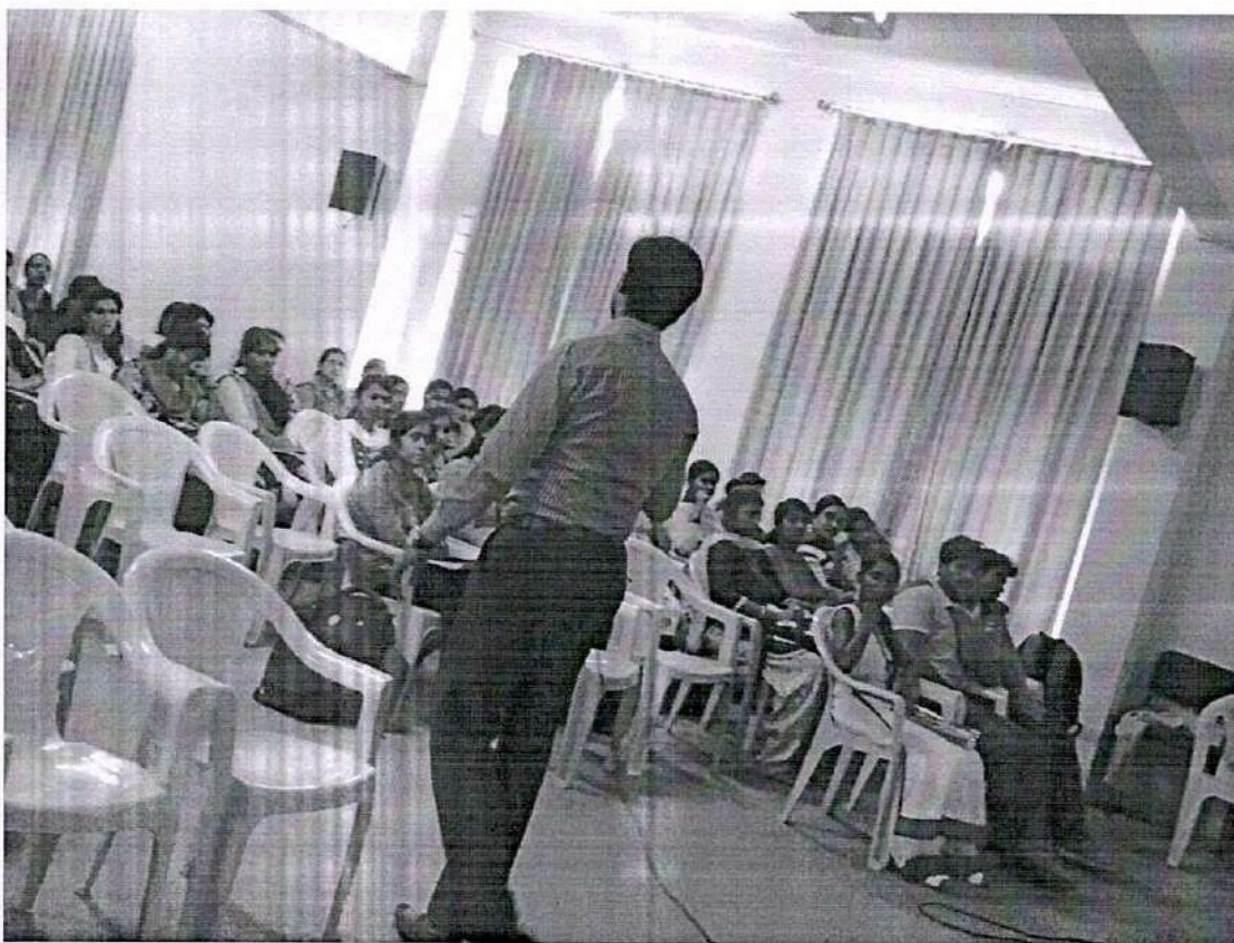
Resource person handling the career counselling session

Co-ordinator Internal Quality Assurance Cell (IQAC) St Francis de Sales College Electronics City Post, Bangalore - 560 100