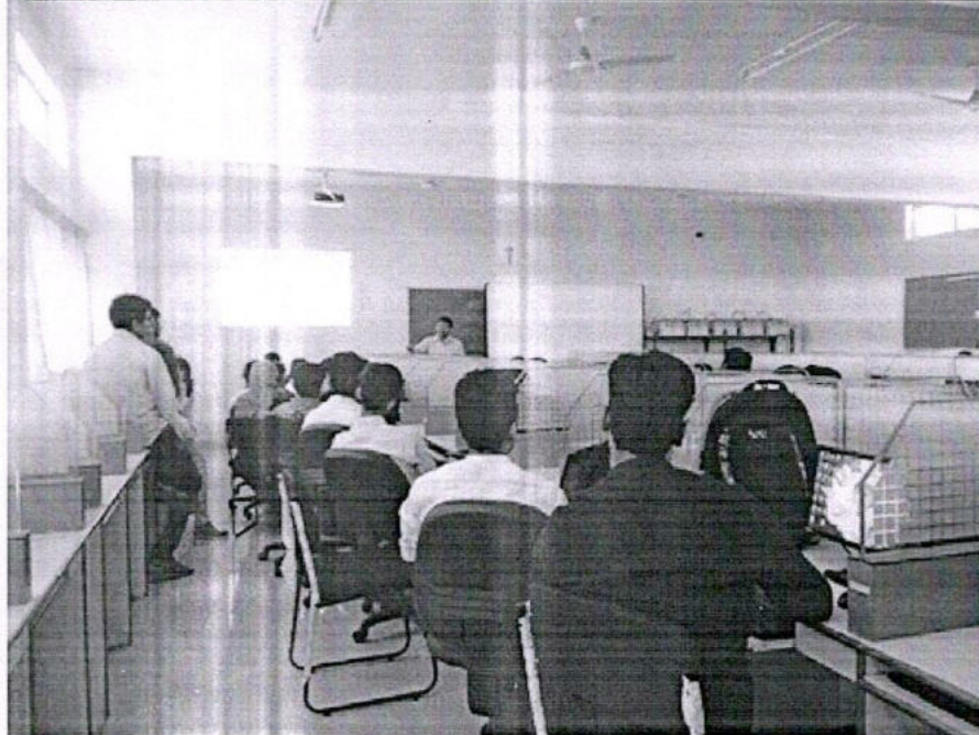
Students are actively participating in the activity conducted on 19th September, 2018.