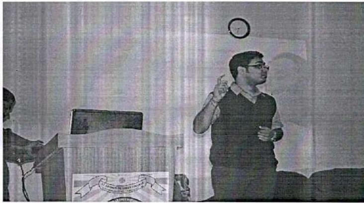
Career Development Session at college seminar hall