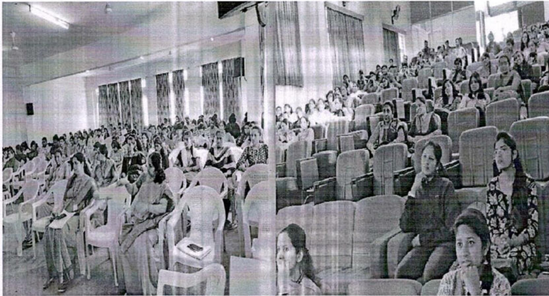
A glance of the Awareness and Prevention of Tobacco Consumption session held on 12 – 22 August 2019.