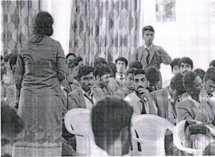
Students interacted with the speaker of the day