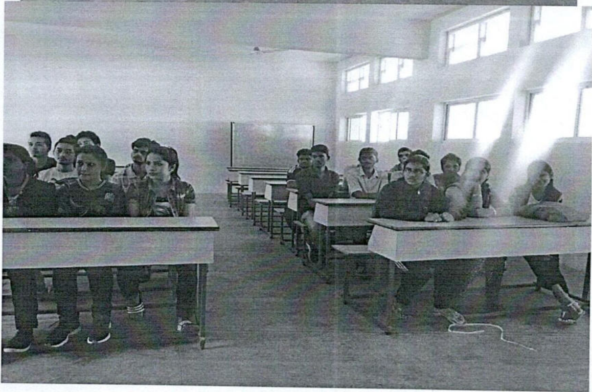
Students attending NET coaching session