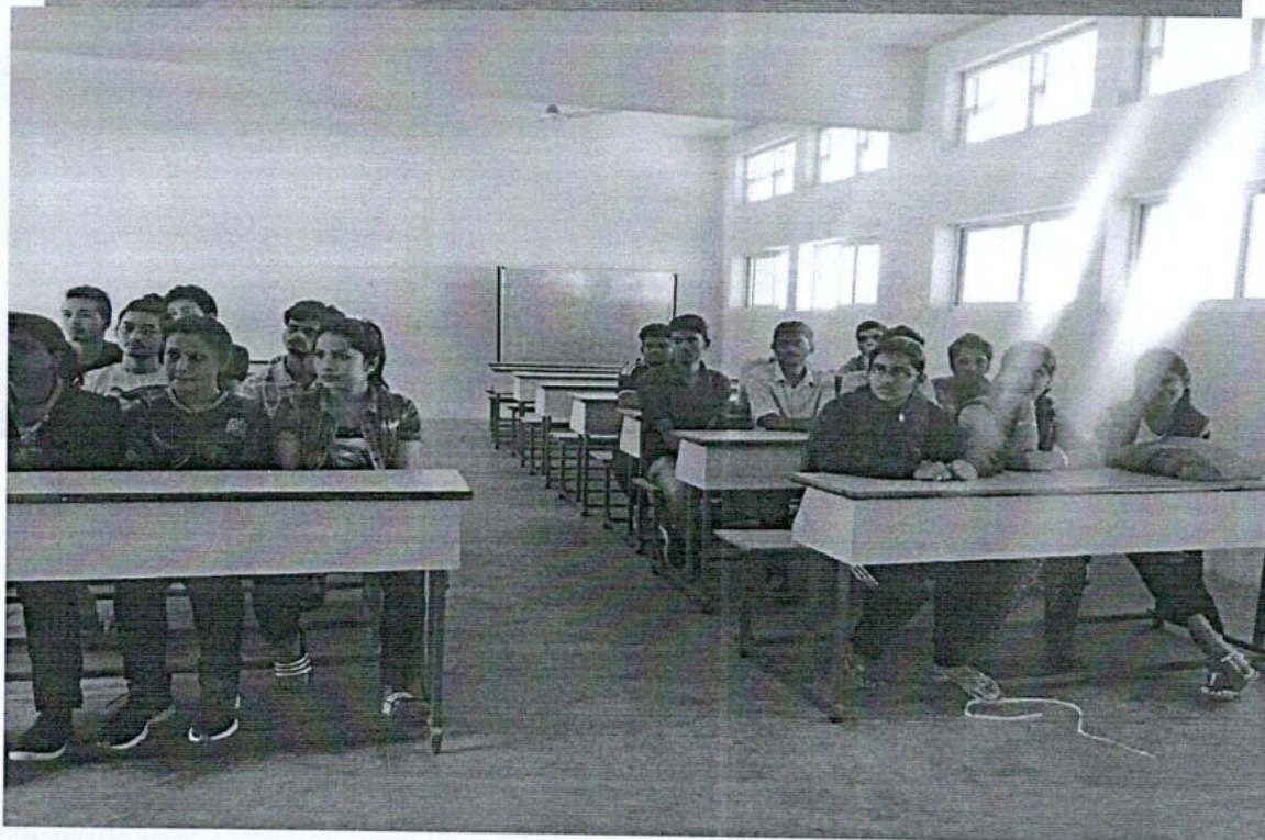
Students attending NET coaching session