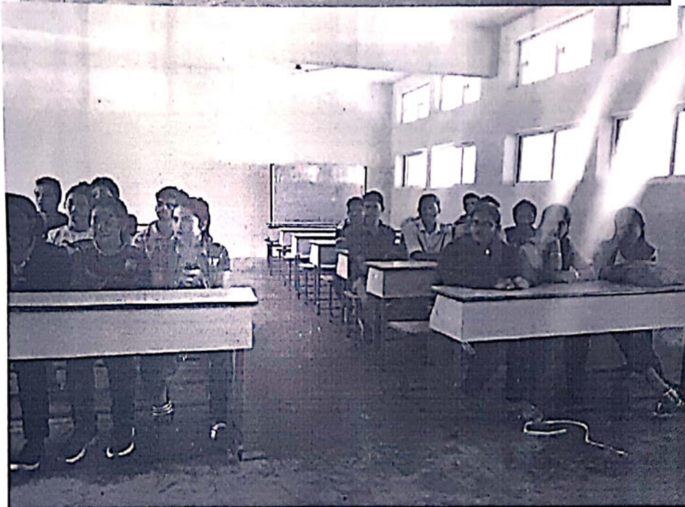
Students attending NET coaching session