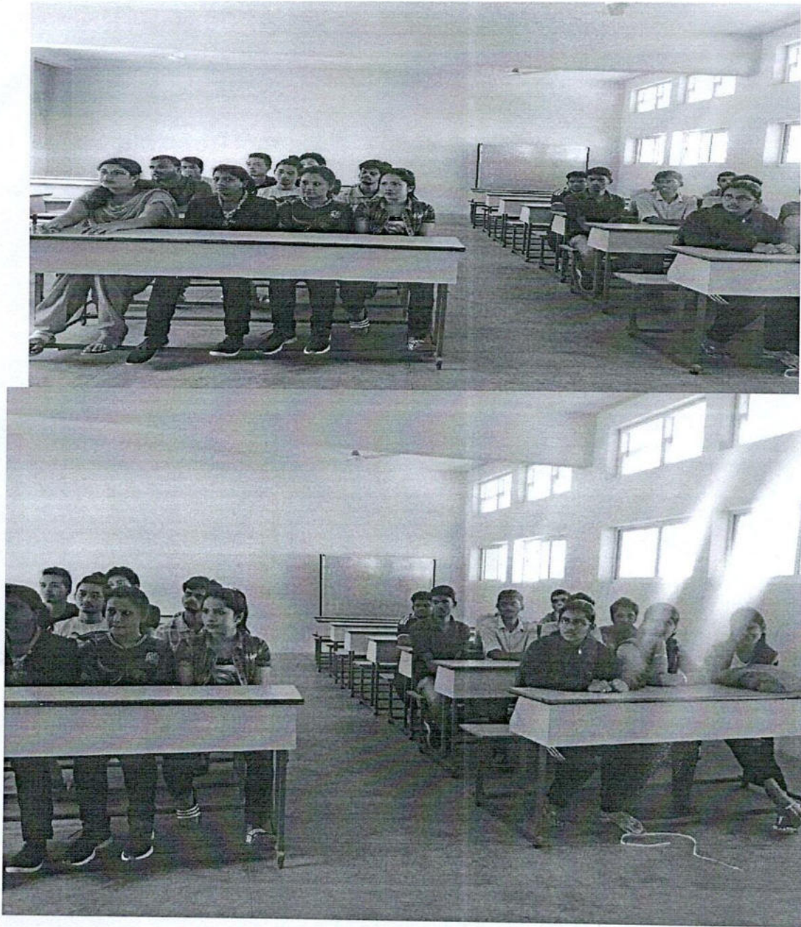
Students attending NET coaching session